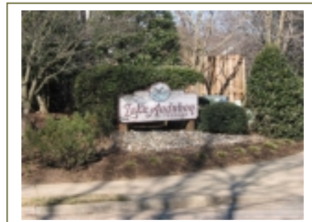
A new light in Lake Audubon.

Light may soon be shed upon the corners of our main entry